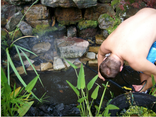
(Pressure washing the waterfall)

As a general rule, you should completely drain and refill your pond yearly. This may not be frequent enough for ponds near or under large numbers of trees.